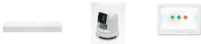
Figure 1. Cisco Webex Room Kit Plus PTZ

The Room Kit Plus PTZ integrator package is rich in functionality and experience, but is priced and designed to be easily scalable to all of your collaboration spaces—whether registered on the premises or to Cisco Webex in the cloud. Figure 1 shows the components of the package.